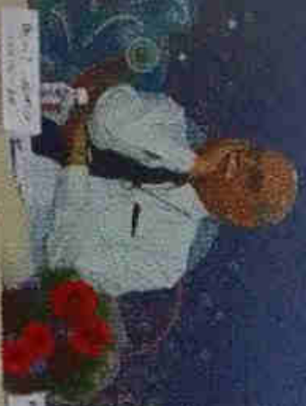
Dr. S. R. Chandrasekhar